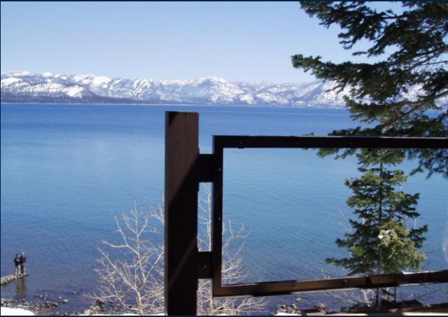
Decks / Railing / Homes for Unobstructed Views