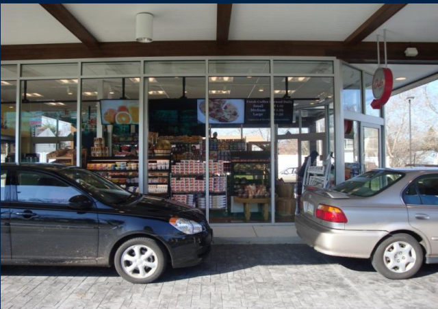
"Drive Thru" Retail