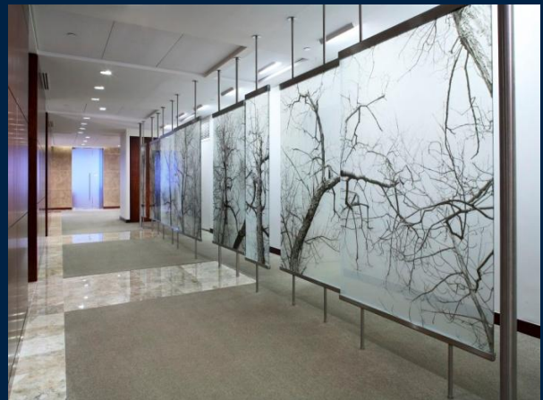
Laminated Glass "Art Work"