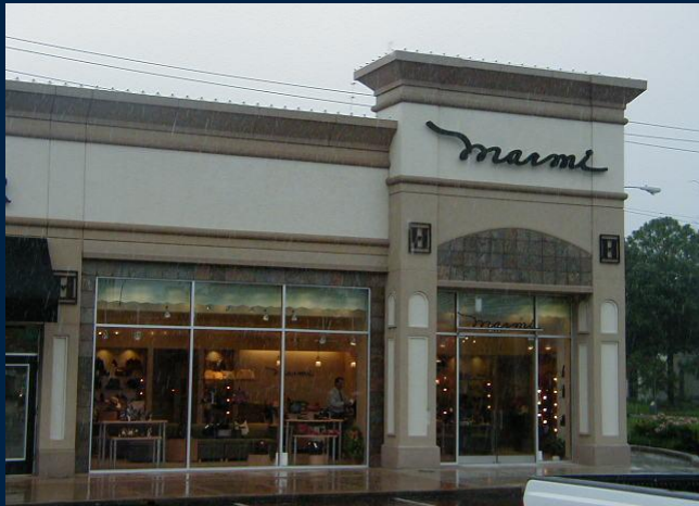
High End Retail Storefronts